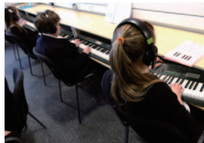
*Headphones not included

When students use multiple keyboards for individual practice in the same room, the use of headphones enables each student to concentrate without distraction.